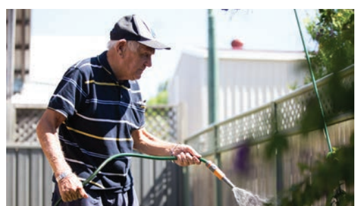
A vegie patch, BBQ and men's shed.

Centrally located in Hamilton, our beautiful, newly renovated federation home offers a tranquil home away from home experience that is unique in the Hunter.