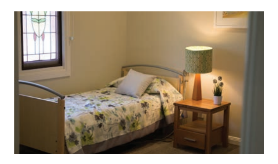
Four private bedrooms with large ensuites.