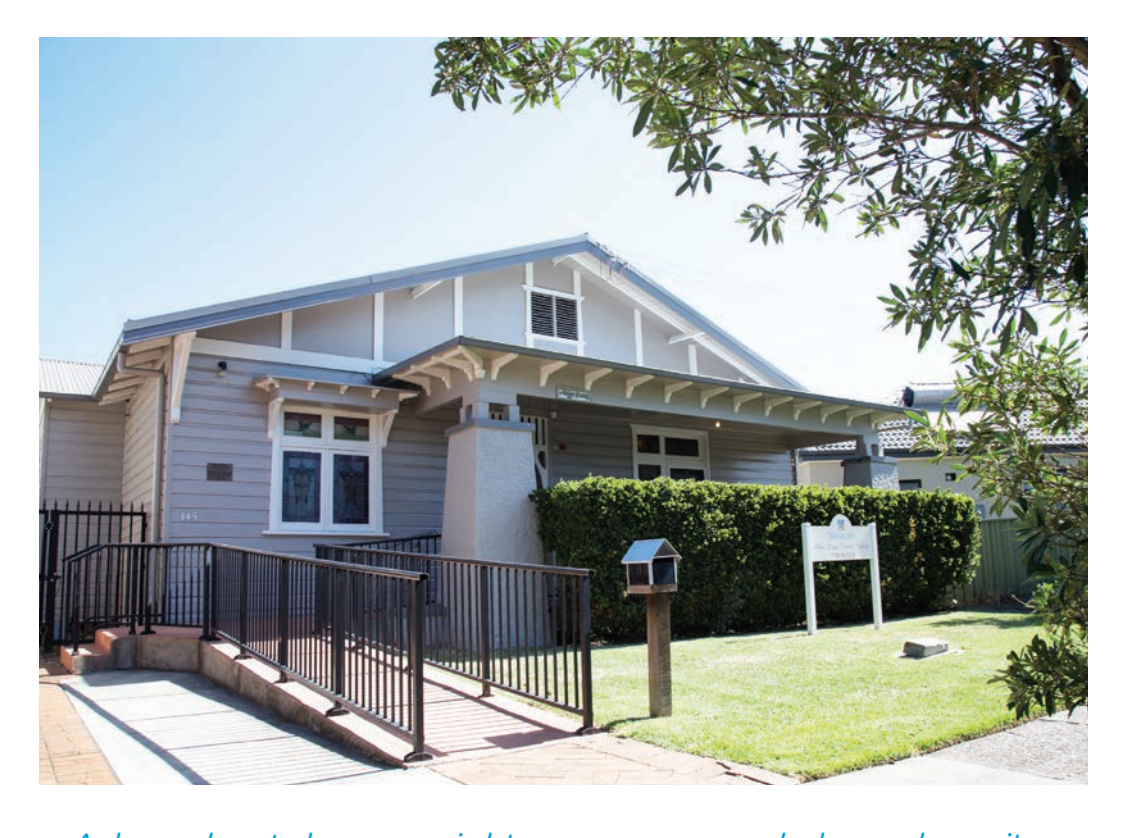
Ask us about day, overnight, emergency and planned respite care in our cottage or in your own home. Ailsa Craig Cottage is Newcastle's only privately owned, overnight respite house.

Centrally located in Hamilton, our beautiful, newly renovated federation home offers a tranquil home away from home experience that is unique in the Hunter.